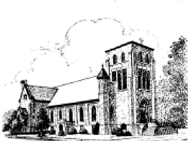
St. Michael Church