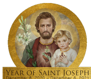
YEAR OF SAINT JOSEPH December 8, 2020 - December 8, 2021