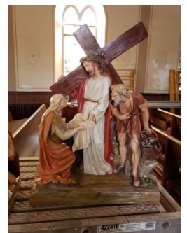
Station 6 Veronica wipes Jesus' face