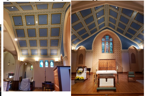
SANCTUARY COMPLETED & BEAUTIFUL FOR THE WEDDING

Painting in the Sanctuary has been completed and it is awesome! Pictures were posted after Masses on Sunday and parishioners caught the excitement for the project that we feel as we watch the project unfold. The design of the reredos is to be finalized this week and moving of the tabernacle to the center will make it the focus of the Sanctuary. Removal of pews and work on the Nave has begun. The project remains on schedule and we are forever grateful for your prayers and support.