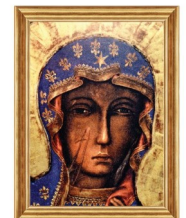
Poland's Black Madonna